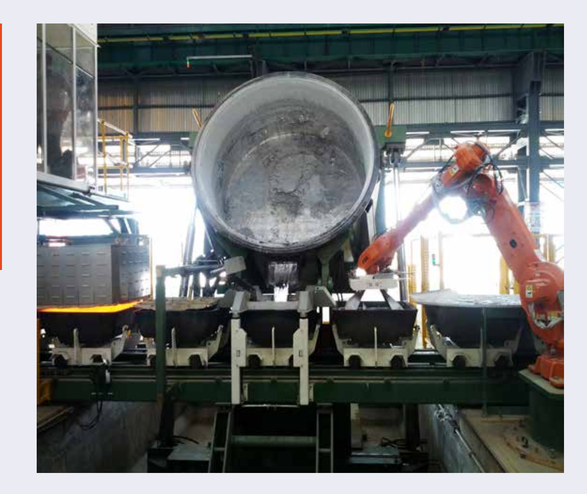
Hydraulically-operated crucible tilters directly into the sow moulds