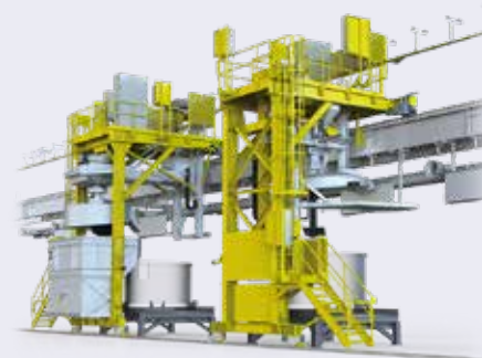
Mounted on rail