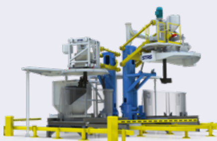
Mounted on mast