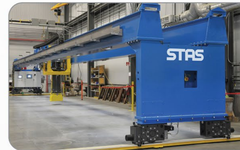
PRM / Pot Ramming Machine