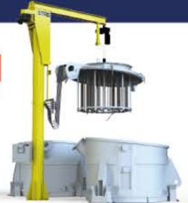
Aluminium Crucible Preheater