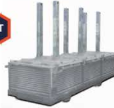
Covered Anode Tray