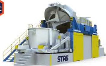
Hot Aluminium Crucible Cleaner