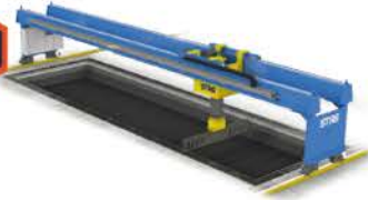
Pot Ramming Machine