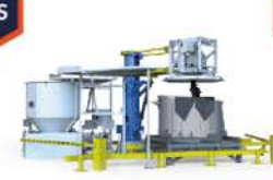
Aluminium Crucible Skimmer