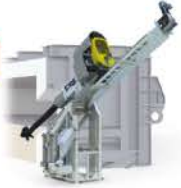
Rotary Flux Injector®