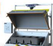
Inert Gas Dross Cooler®