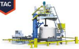
Treatment of Aluminium in Crucible®