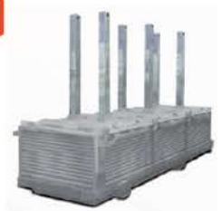
Covered Anode Tray