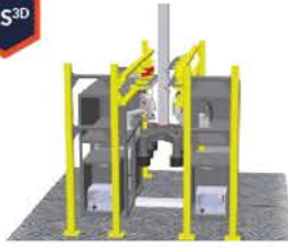
3D Clad Inspection System