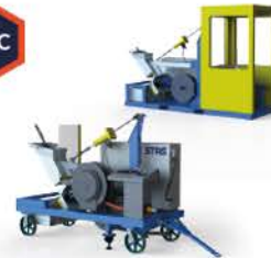
Siphon Pipe Cleaner