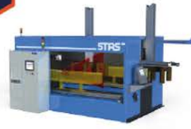
3D Anode Stub Inspection System