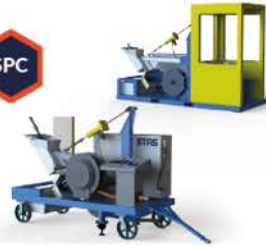
Siphon Pipe Cleaner