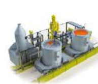
Robot Aluminium Crucible Skimmer