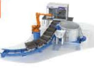
Sow Casting and Stacking