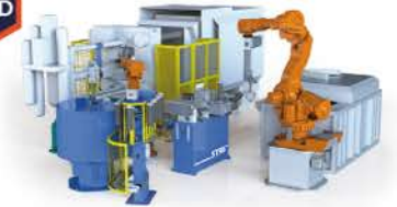
Swirled Enthalpy Equilibration Device