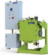
Flux Feeder for Degasser