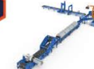
Ingot Casting and Stacking