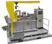
Advanced Compact Filter