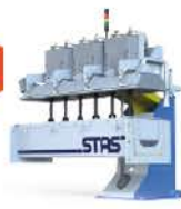
Aluminium Compact Degasser®