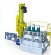
Aluminium Inline Refiner