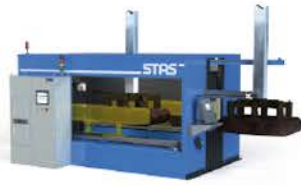
3D Anode Butt Inspection System